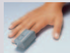
3044 Finger Sensor