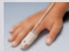
1300 Adult Sensor