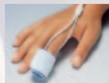
3043 "Y" Sensor (with 3138)