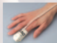
1310 D.O.T. Sensor (with 1311)