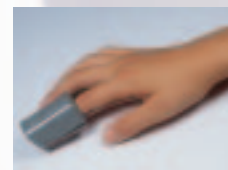
3044 Finger Sensor