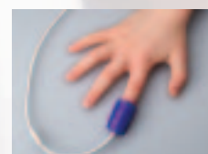
3178 Finger Sensor