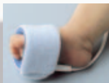
3026 Wrap Sensor (with 3138)