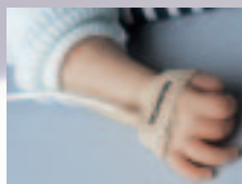
1302 Neonate Sensor