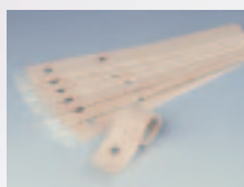
Attachment Tape 3134/3136 Neonate 3135/3137 Infant