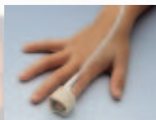
3025 Wrap Sensor (with 3135)