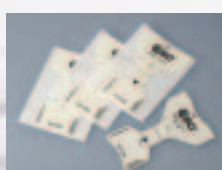
D.O.T. Attachment Tape 1311 D.O.T. Sensor Replacement Tape