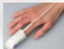
3444 Comfort Clip®