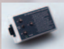
1606 Oximeter/ ECG Simulator