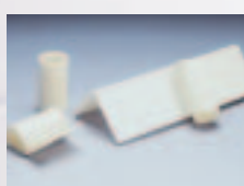
Microfoam Tape 3049 Adhesive Strip