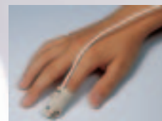
1301 Pediatric Sensor