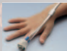
3043 "Y" Sensor (with 3135)