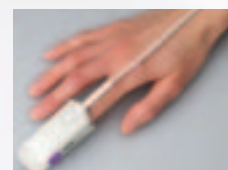
3444 Comfort Clip®