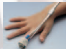
3043 "Y" Sensor (with 3135)